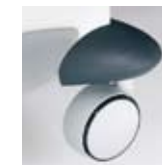
Castor with brake

Zimmer MedizinSystems Corp. 25 Mauchly, Suite 300 Irvine, CA 92618 Phone (800) 327-3576 Fax (949) 727-2154 info@zimmerusa.com www.zimmerusa.com