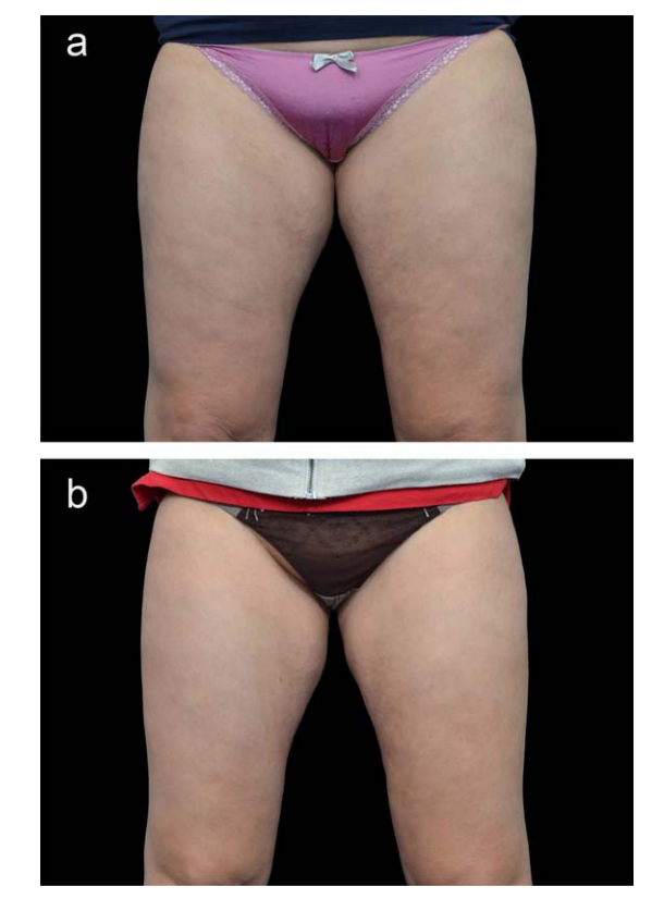
FIG. 4. Patient before (a) and after (b) treatment. [Color figure can be viewed in the online issue, which is available at wileyonlinelibrary.com.]

The purpose of this study was to evaluate the efficacy and safety of a contactless RF applicator designed for thigh circumferential reduction.