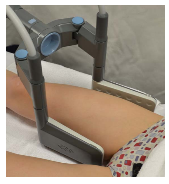
FIG. 1. Thigh applicator treatment setup. [Color figure can be viewed in the online issue, which is available at wileyon-linelibrary.com.]

Most desired treatment areas include abdomen, flanks, and thighs. Adipose tissue metabolism varies from one region of the body to another. For example, the lipolytic process is generally slower in the thigh area than in the abdominal region. The process of lipolysis is inhibited through the presence of \alpha -2 adrenergic receptors on the fat cells surface. Women, as a result of higher levels of estrogen, have more \alpha -2 adrenergic receptors on the fat cells on their hips and thighs. Thus, these areas are one of the most critical by women in the sense of occurrence and reduction (1).