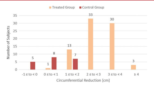
FIG. 2. Circumferential reductions among treated group and control group (includes both legs). [Color figure can be viewed in the online issue, which is available at wileyonlinelibrary.com.]

The device is engineered to focus the energy mainly into the subcutaneous adipose tissue. Selectivity of the device is achieved through the specific impedance of adipose tissue. Surrounding tissues have lower impedance (dermis, epidermis, and muscles), therefore, they remain unaffected (3). The adipose tissue is dielectric