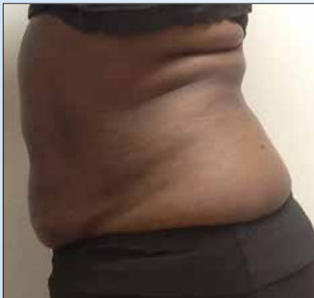
Four weeks after fourth BTL Vanquish ME Tx

to come back in four times, but not many patients are willing to stay for one six hour treatment either."