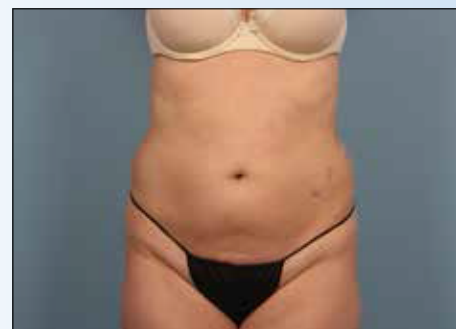
After BTL Vanquish ME Tx