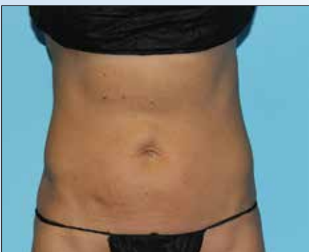
After BTL Vanquish ME Tx