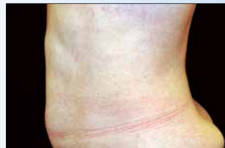
After BTL Vanquish ME Tx