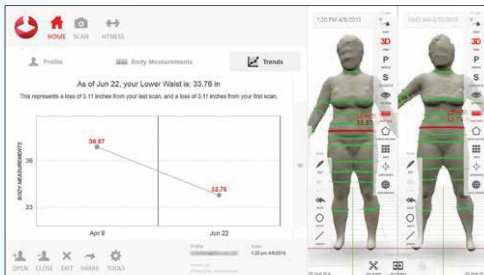
myBodee 3D Scan shows 3.11 inch loss from waist after four BTL Vanquish ME treatments

BTL Vanquish ME causes no post-procedure discomfort and requires no recovery time. “Patients can put their clothes on and go right back to work,” Mr. Bailey reported.