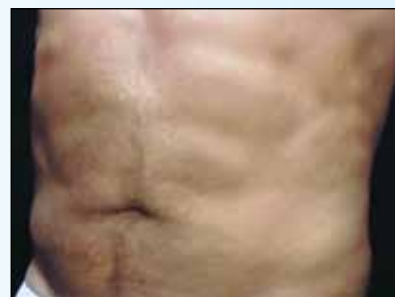
50 year old male ten weeks after six BTL Vanquish ME treatments