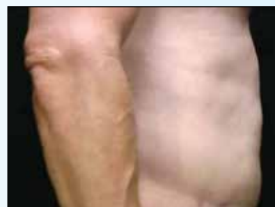
58 year old male ten weeks after six BTL Vanquish ME treatments

*Photos represent still images extracted from 360° imaging video via Dr. Mueller's IC360 System. To see full 360° rotational videos please visit: www.btl aesthetics.com/360-1 or www.btl aesthetics.com/360-2