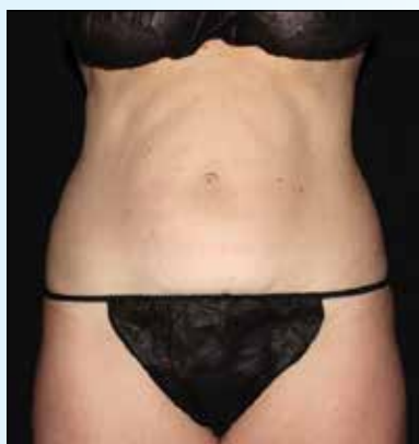
After four BTL Vanquish ME treatments