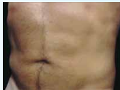
50 year old male ten years post liposuction presenting with asymmetry, residual fat deposition and loss of skin turgor before 1x