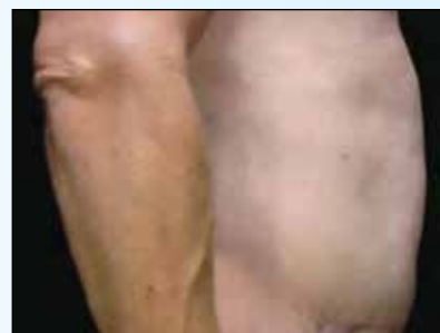
58 year old male post abdominoplasty requesting improved symmetry and reduction of fat deposits before 1x