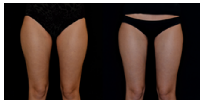
Before and After Vanquish Flex Treatment of Thighs

For more information about the Company's Aesthetic division, please visit btl.aesthetics.com .